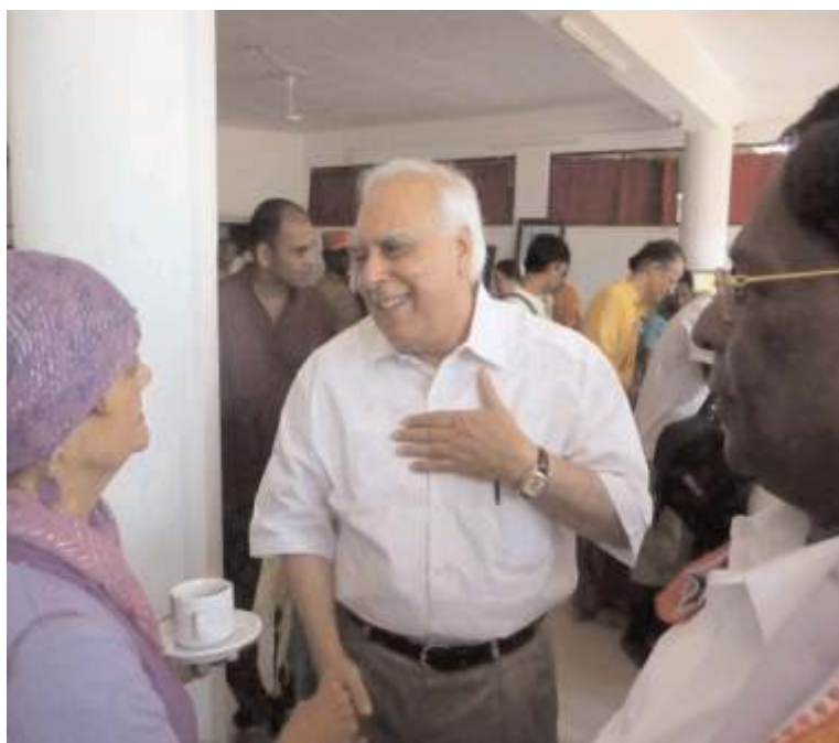
Human Resource Minister Shri Kapil Sibal (middle) in informal conversation with an Auroville resident during tea after the book release. Shri V. Narayanasamy, Union Minister of State for Planning Parliamentary Affairs and Culture, looks on.

On 12 th July 2010, Auroville was honoured by the visit of Shri Kapil Sibal, Human Resource Development minister and Shri V. Narayanasamy, Union Minister of State for Planning Parliamentary Affairs and Culture. The main purpose of their brief visit was to release an illustrated educational book “Passage” prepared by teachers and students of the Last School. The book was published by Sri Aurobindo International Institute of Educational Research, SAIIER, Auroville. However, it was a pleasant experience for us when in his address to the community, Shri Kapil Sibal dwelt on his philosophy of life, his aspirations and thoughts. From that and from his informal meetings with the Aurovilians, we had the glimpses of a person whom we would