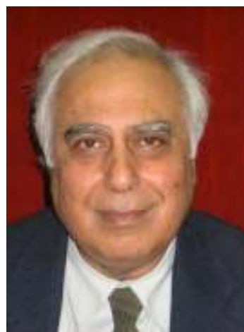
Shri Kapil Sibal

"Auroville is larger than life, Auroville is much more than India. Auroville encompasses within itself the spirit of the world, the spirit of human beings. What you are doing in Auroville is what I think the world community should be doing..... In diversity, you discover the unity of the human race. That is the celebration of Auroville. Let's all celebrate it and take it forward."