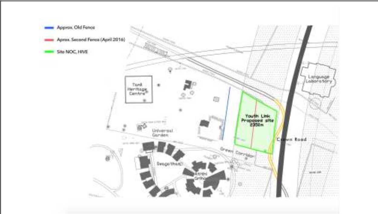
April 2016: New Fence Built on Hive Plot by Pumphouse Residents, without Permission from TDC.