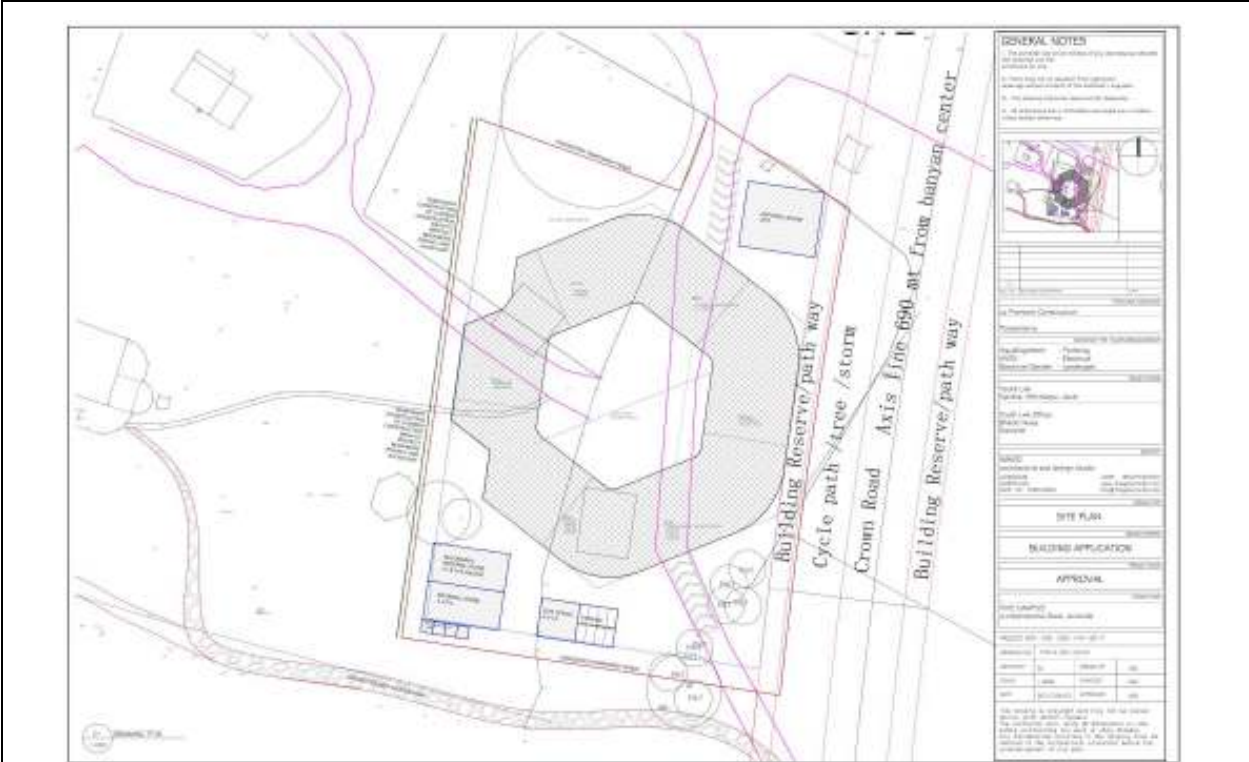
35 Meters from Closest Pumphouse Neighbor. Safe Road Access identified by TDC for Pumphouse & Hive