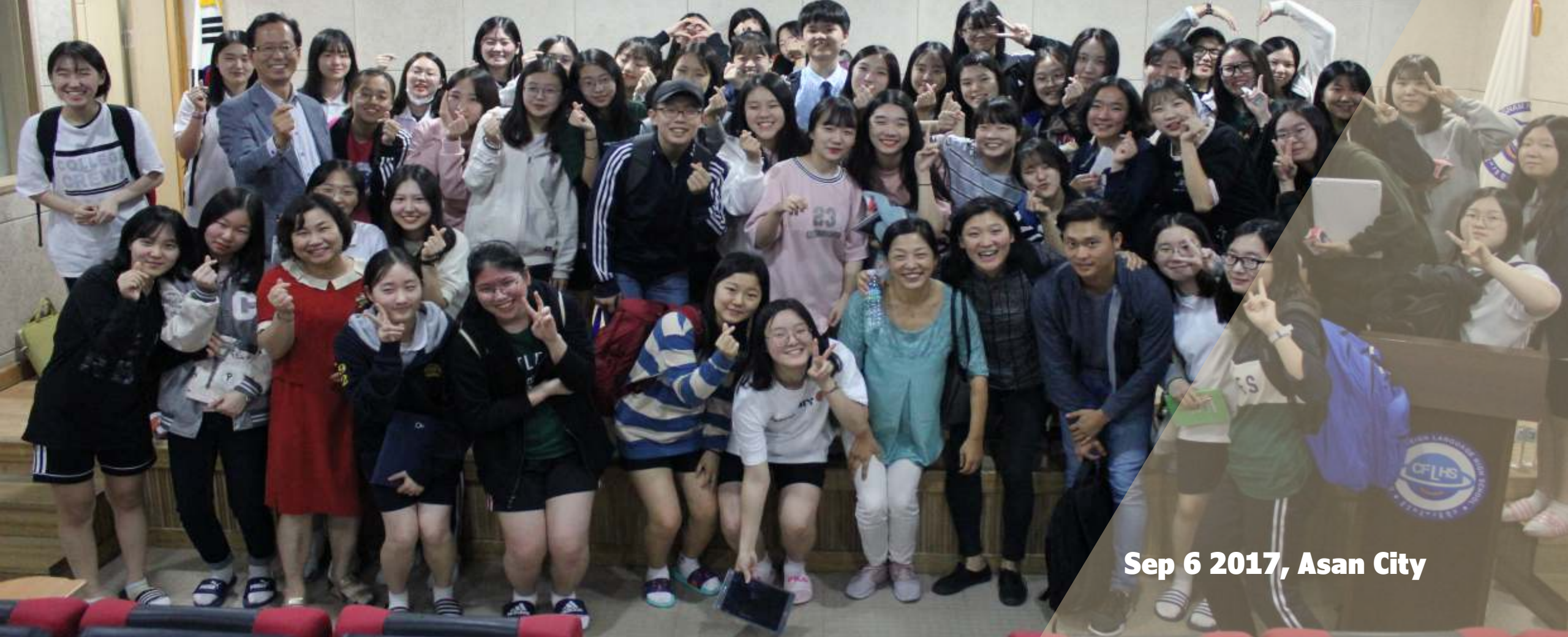
Sep 6 2017, Asan City