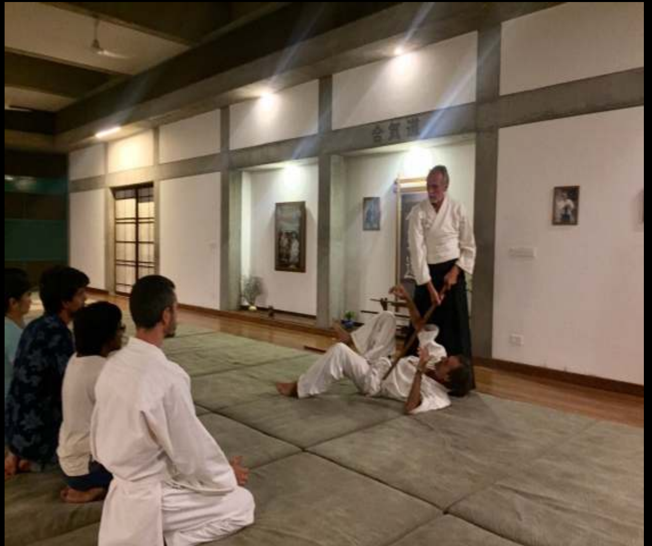
Budo : Kyudo / Aikido / Waraku