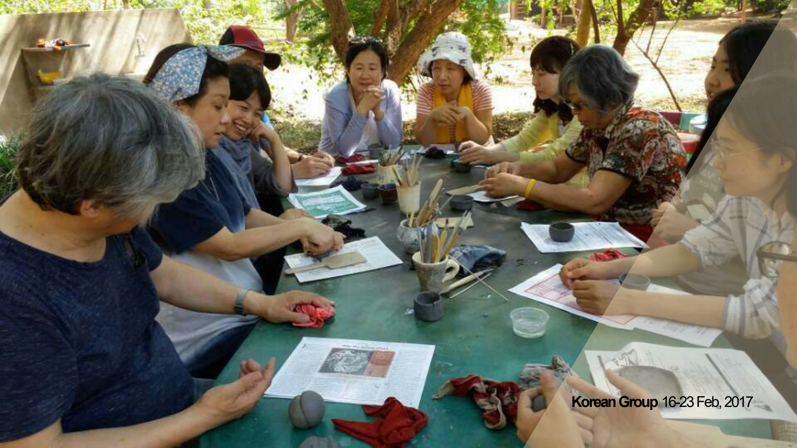
Korean Group 16-23 Feb, 2017